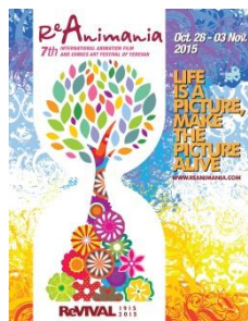
International Festival of animated film and comic art «ReAnimation»