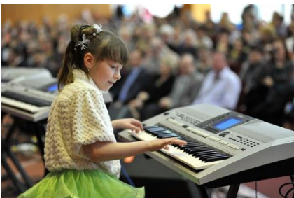
Second international Congress «The Project – Music for everyone»