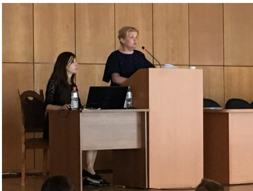
Congress of representatives of socio–professional associations (subject associations) teachers of school subjects