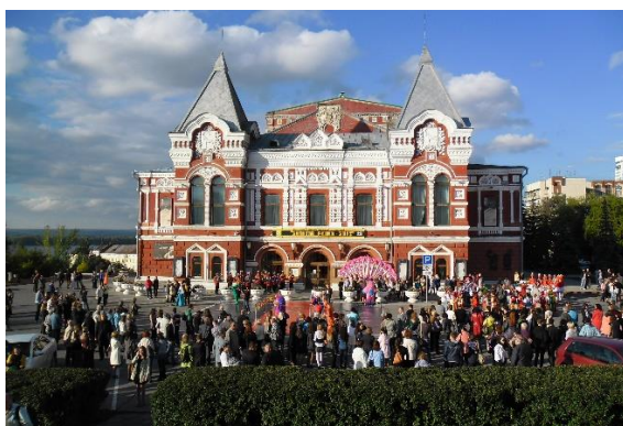
National festival-laboratory of the theaters for children «Golden turnip»